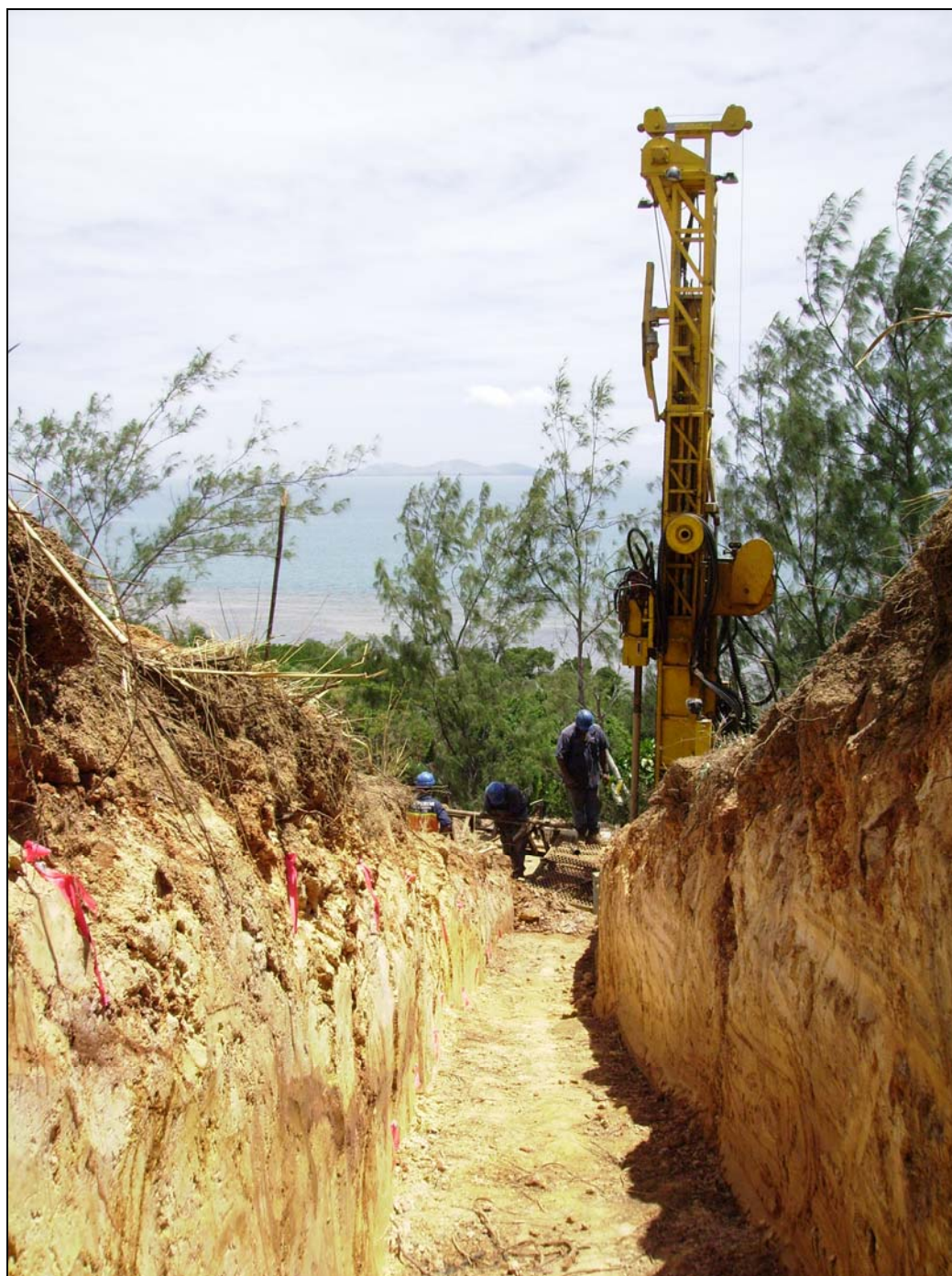
Figure 2. Northern end of trench FT2 at the NE Gossan zone of the Faddy's Gold Deposit. Note that the mineralized gossan is mostly soft, poorly indurated rock and that soil cover is thin. High grade mineralization (1m of 233g/t Au within a zone of 28m of 9.71g/t Au) occurs along this part of trench FT2.